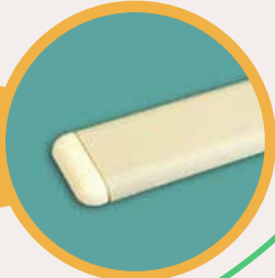
WALL GUARD ALUMINIUM WITH PVC SIZE : 100 mm