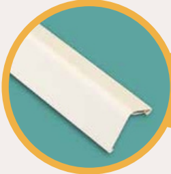
CORNER GUARD ALUMINIUM WITH PVC SIZE : 52×52 mm