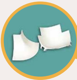
ALUMINIUM 2D, 3D CORNER