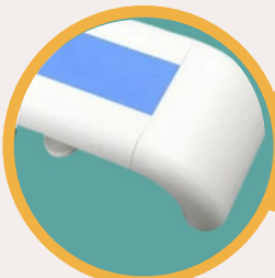
HANDRAIL ALUMINIUM SIZE : 140mm