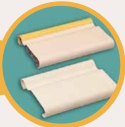
HAINDRAIL ALUMINIUM WITH PVC SIZE : 157 mm