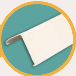
CORNER GUARD ALUMINIUM WITH PVC SIZE : 72×72 mm